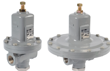
Fisher MR95H and MR95L Series Pressure Reducing Regulators

Fisher MR95 pressure reducing and MR98 backpressure, relief and differential relief regulators are compact, and provide a large turndown ratio and tight shutoff. They are highly configurable, with a broad range of trim options to meet a wide range of application needs, from pneumatic supply, to boiler feed water, to chemical processing. The easy maintenance design minimizes complexity and simplifies technician preventative maintenance requirements.